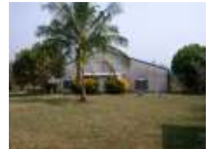
Mathetes Baptist Bible College, Ho, Ghana